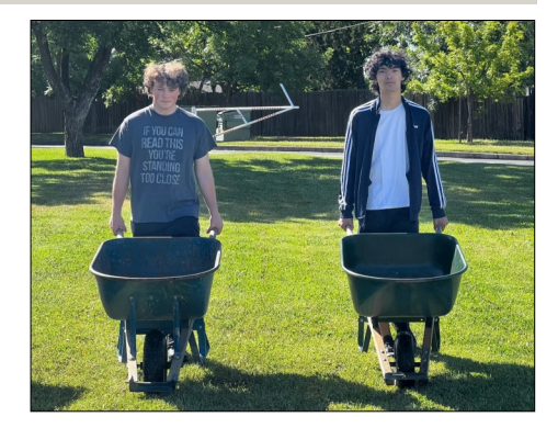
Church Work Day, May 2023

This year has had a handful of noticeable changes and improvements around the church property. First we had several trees pruned, two dead ones removed and three stumps ground out. I never like removing trees but they just were not safe in addition to being an eyesore. Overall though, the arborist said our trees looked pretty heathy. Another improvement, slightly less noticeable, is a new mini split HVAC in the CE office. This replaced one that was outdated and leaking. It will be more efficient and effective than the old one. The most noticeable improvement has been the pavement repair, sealcoat and restricting of the entire parking lot. Though it is not meant to fill cracks, it will extend the life of the pavement and at the very least make the parking stalls more noticeable. Upcoming projects are security, possibly marquee sign upgrades, plus an overall objective of improving noticeability and curb appeal.